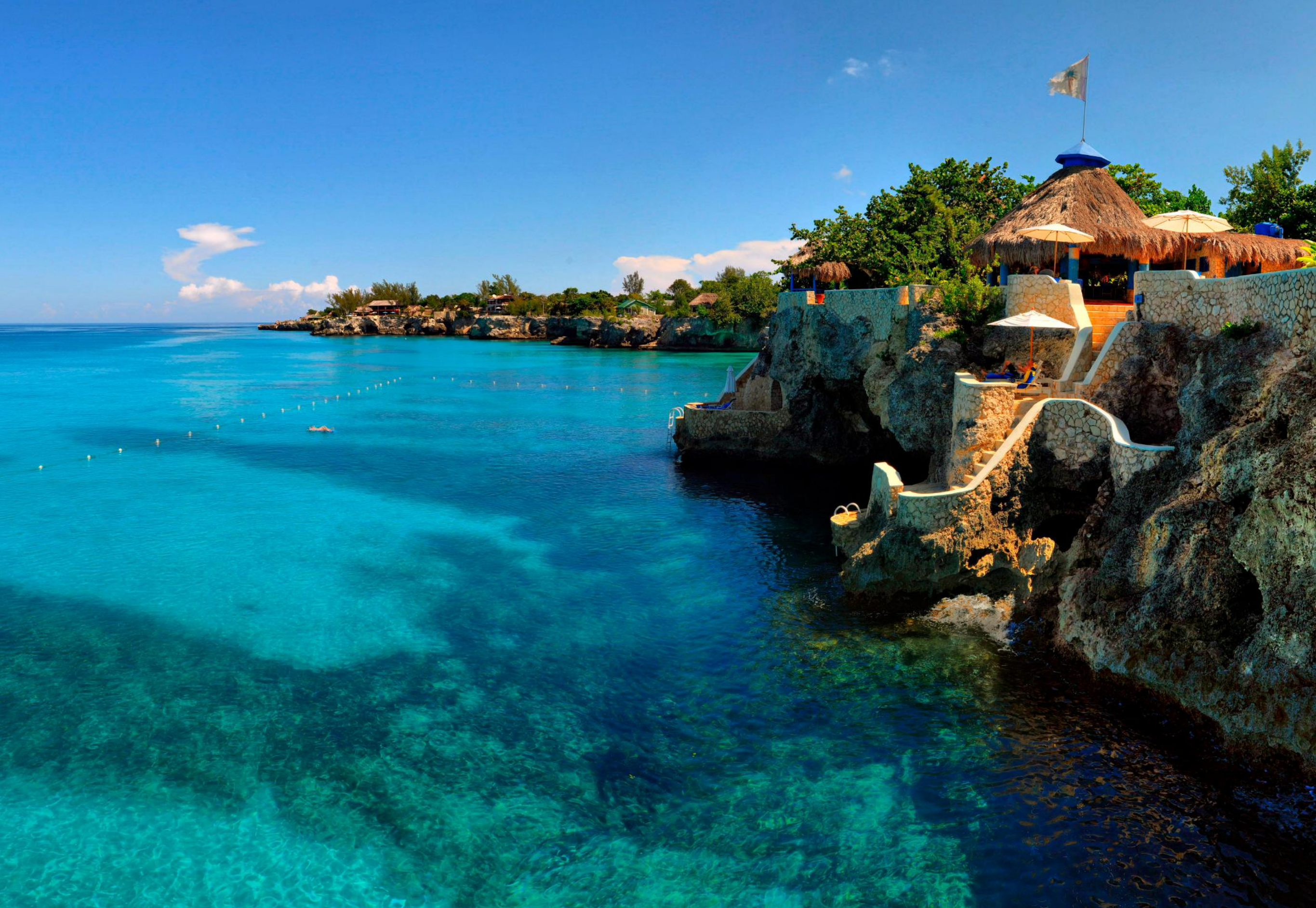
The Caves - 11 Cliffside Cottages and Suites