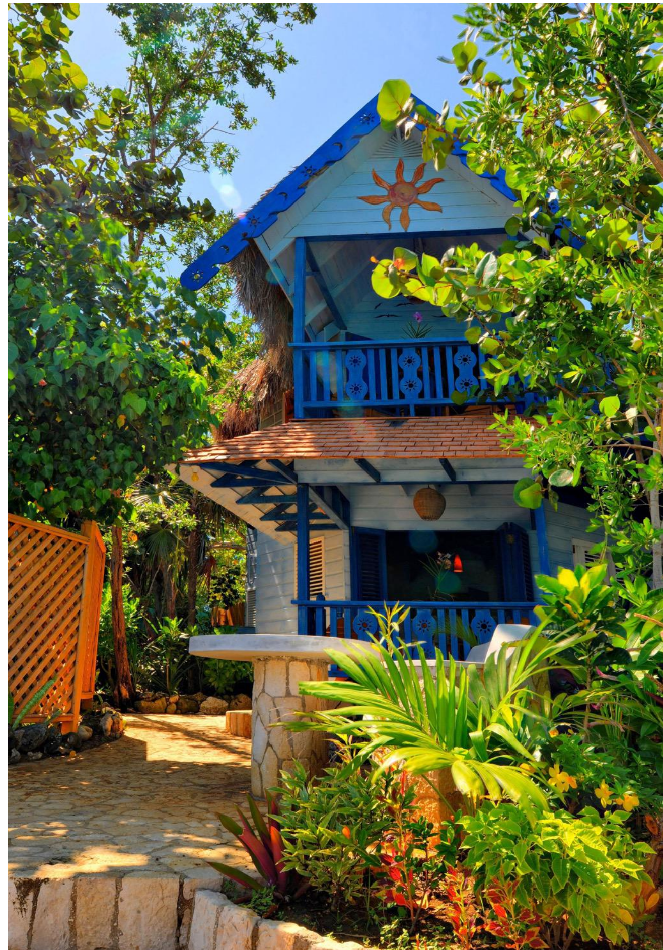
The Caves - One Bedroom Sea View Cottage - 384 sq. ft.