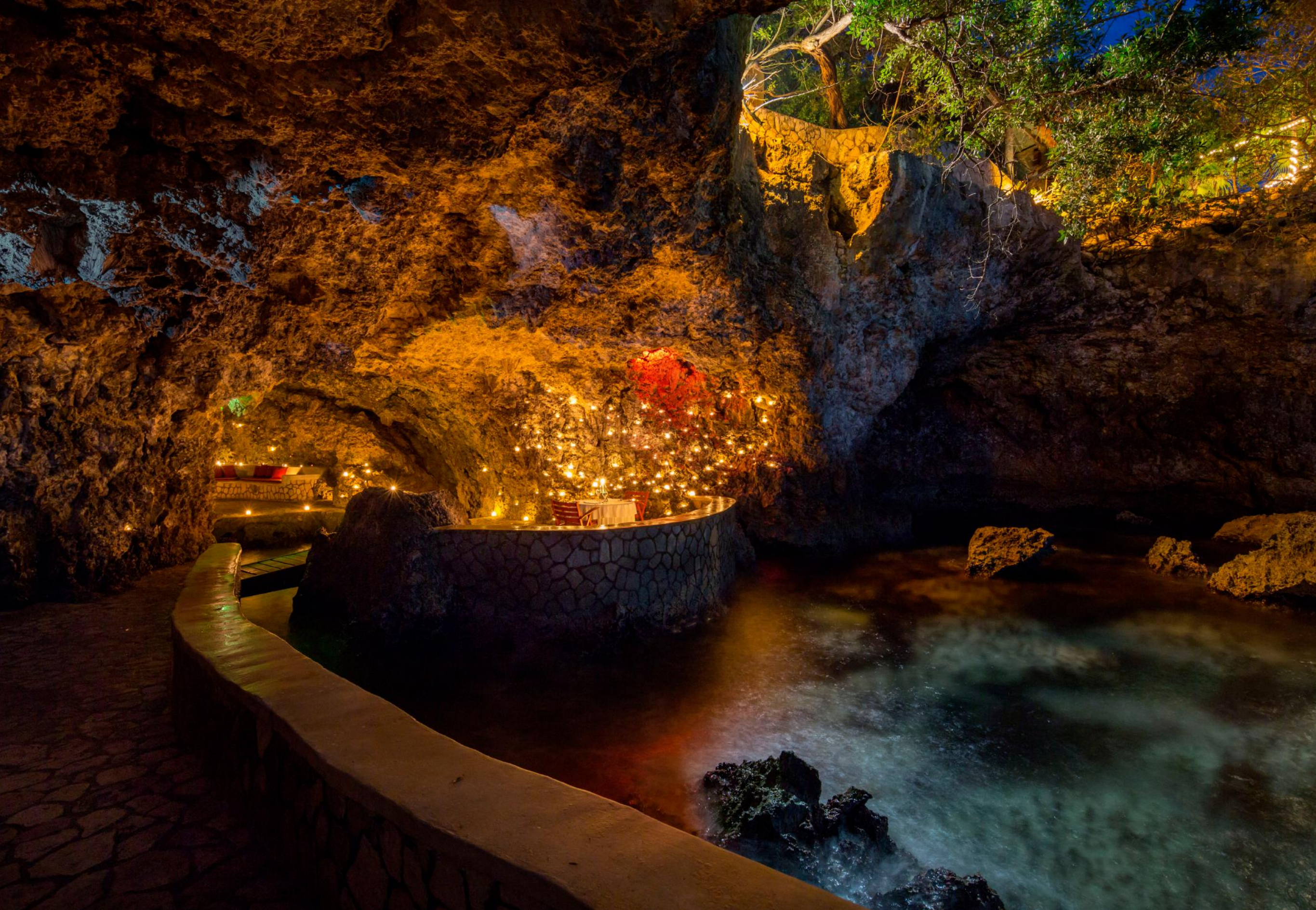
The Caves - Private cave dining experience