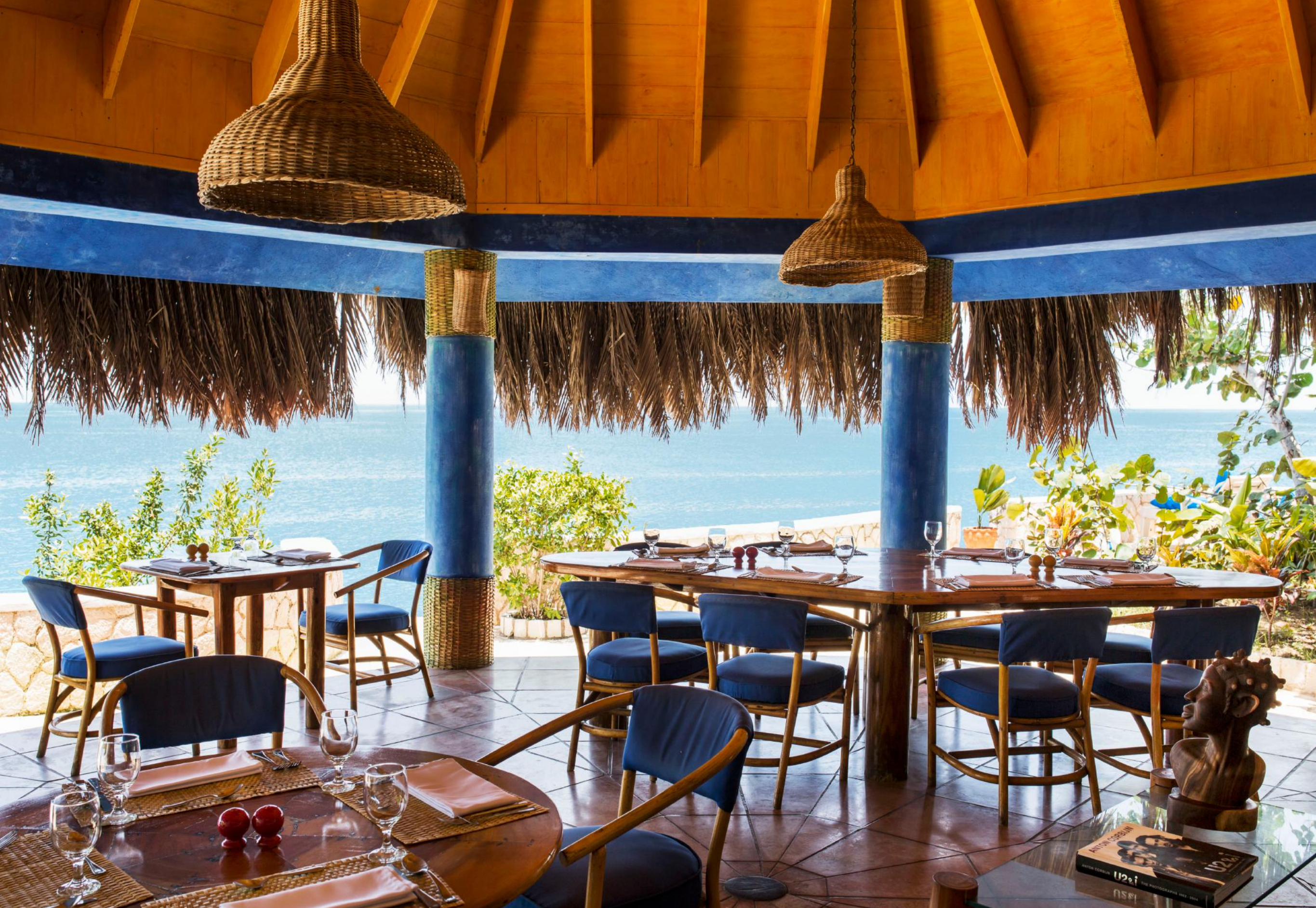
The Caves - The seafront restaurant & bar