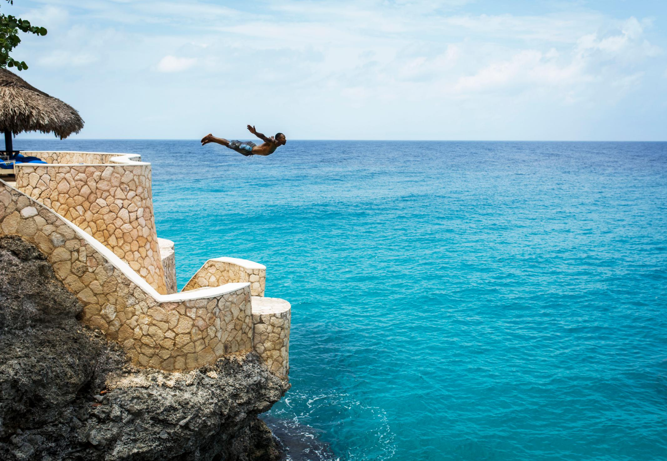
The Caves - Cliff diving, snorkeling expeditions, paddle boarding...