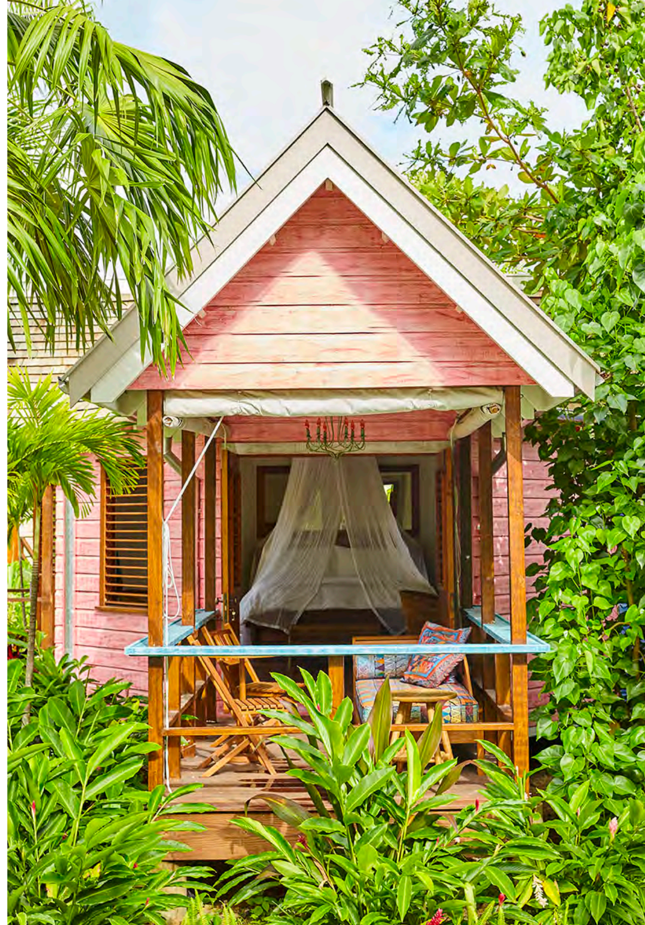
GoldenEye - One & Two-Bedroom Beach Huts – 425 to 1,050 sq. ft.