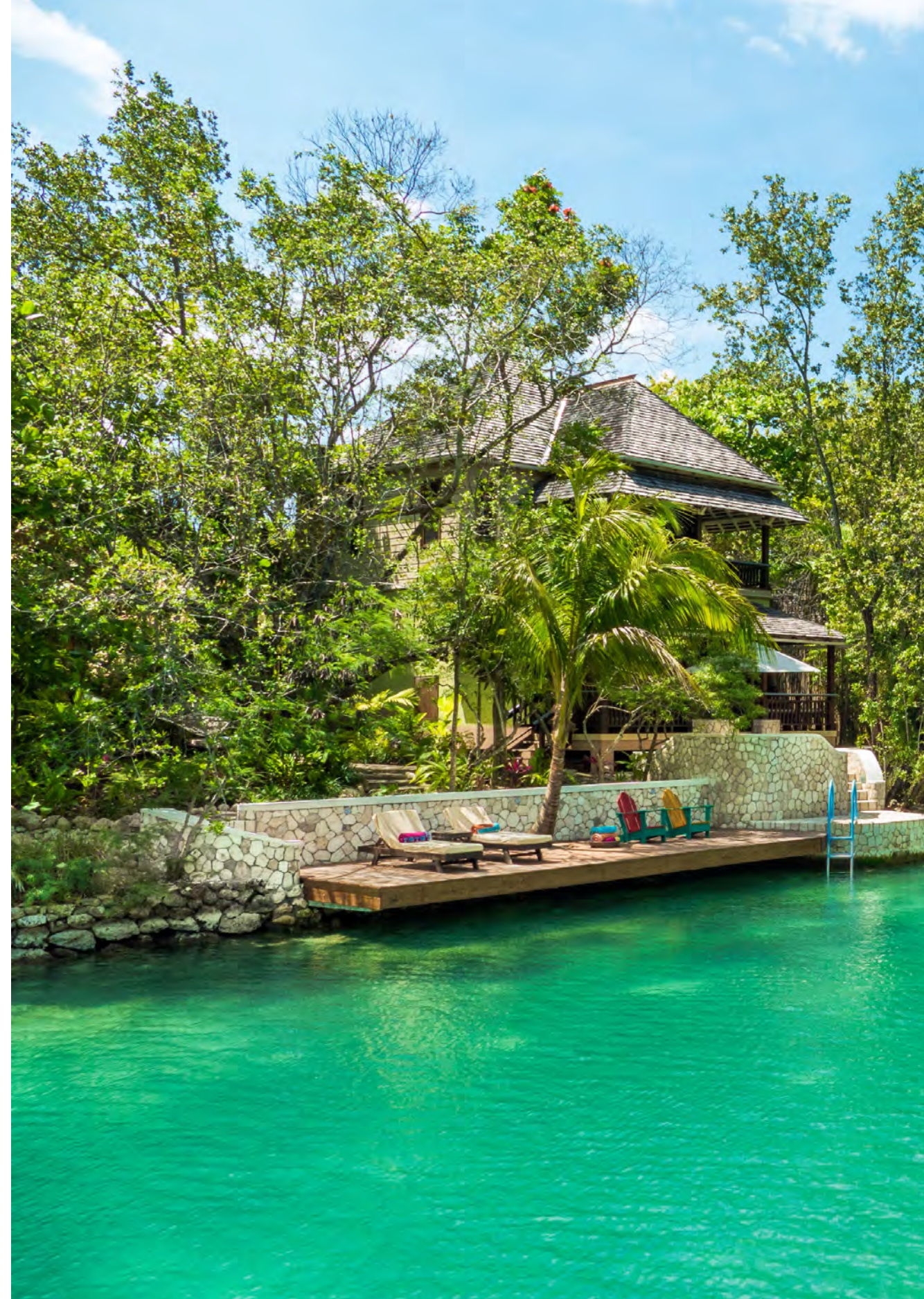
GoldenEye - One and Two-Bedroom Lagoon Villas – 1,100 to 1,711 sq. ft.