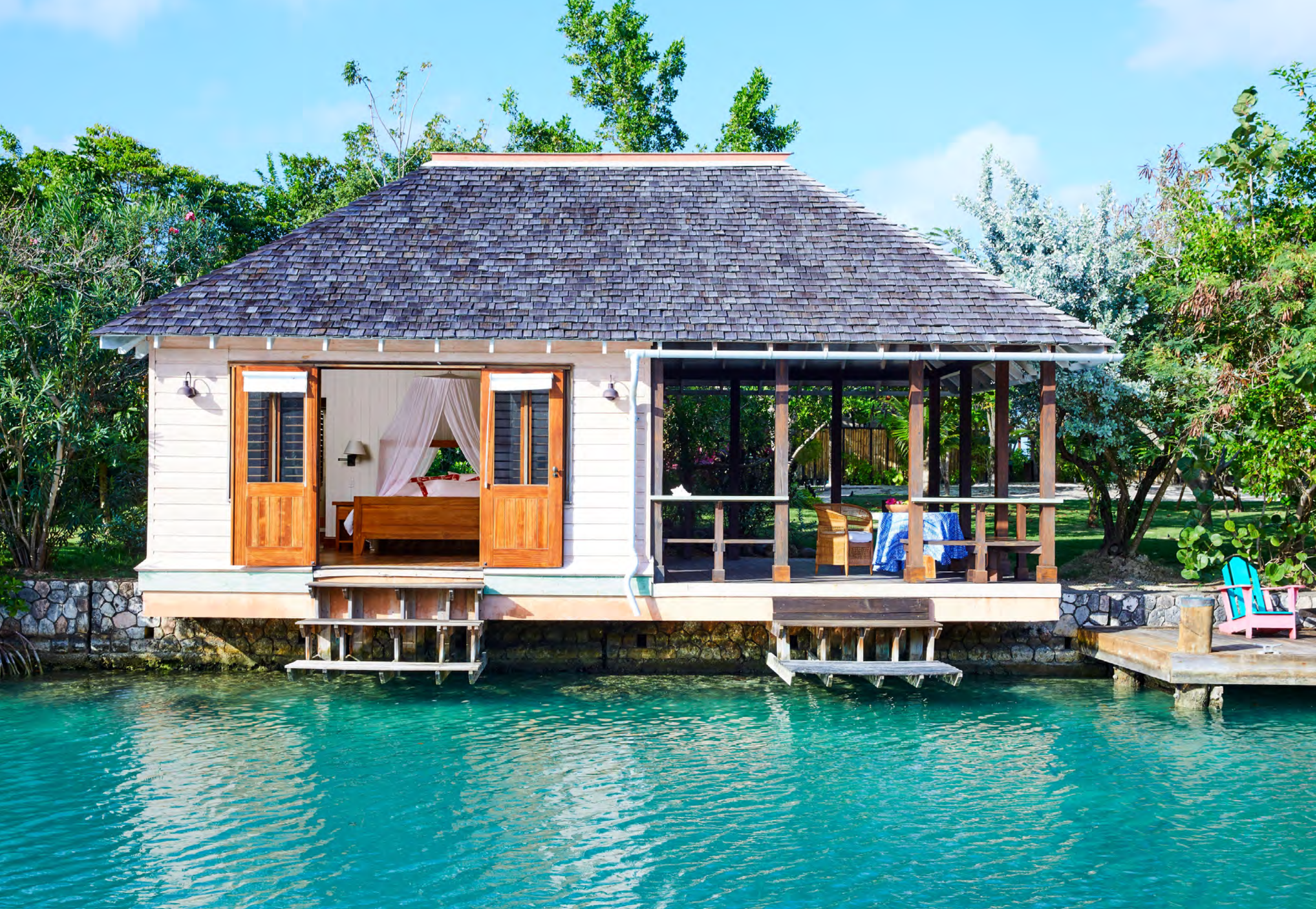
GoldenEye - One Bedroom Lagoon Cottage 720 sq. ft.