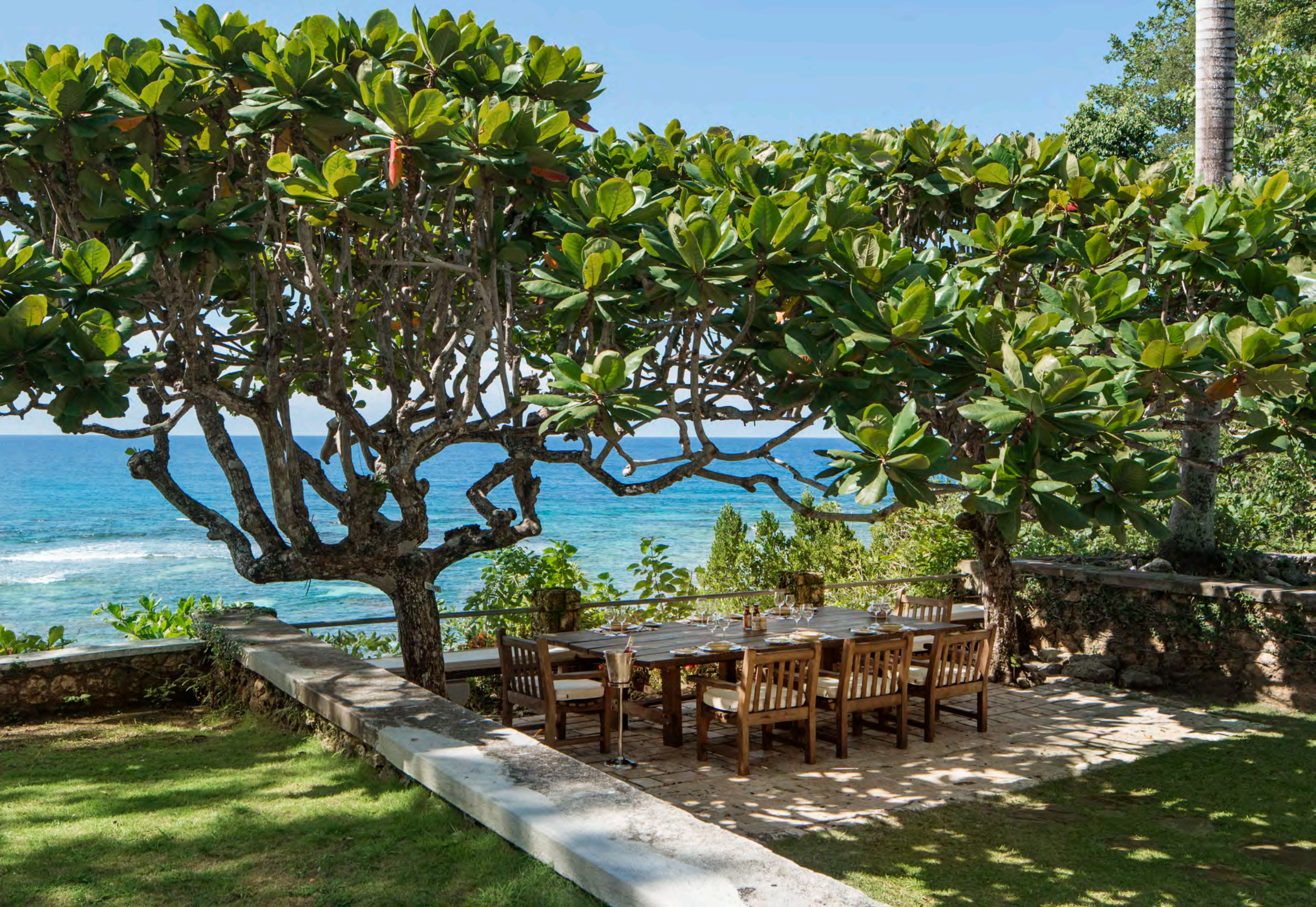
The Fleming Villa - Al fresco dining under the almond trees