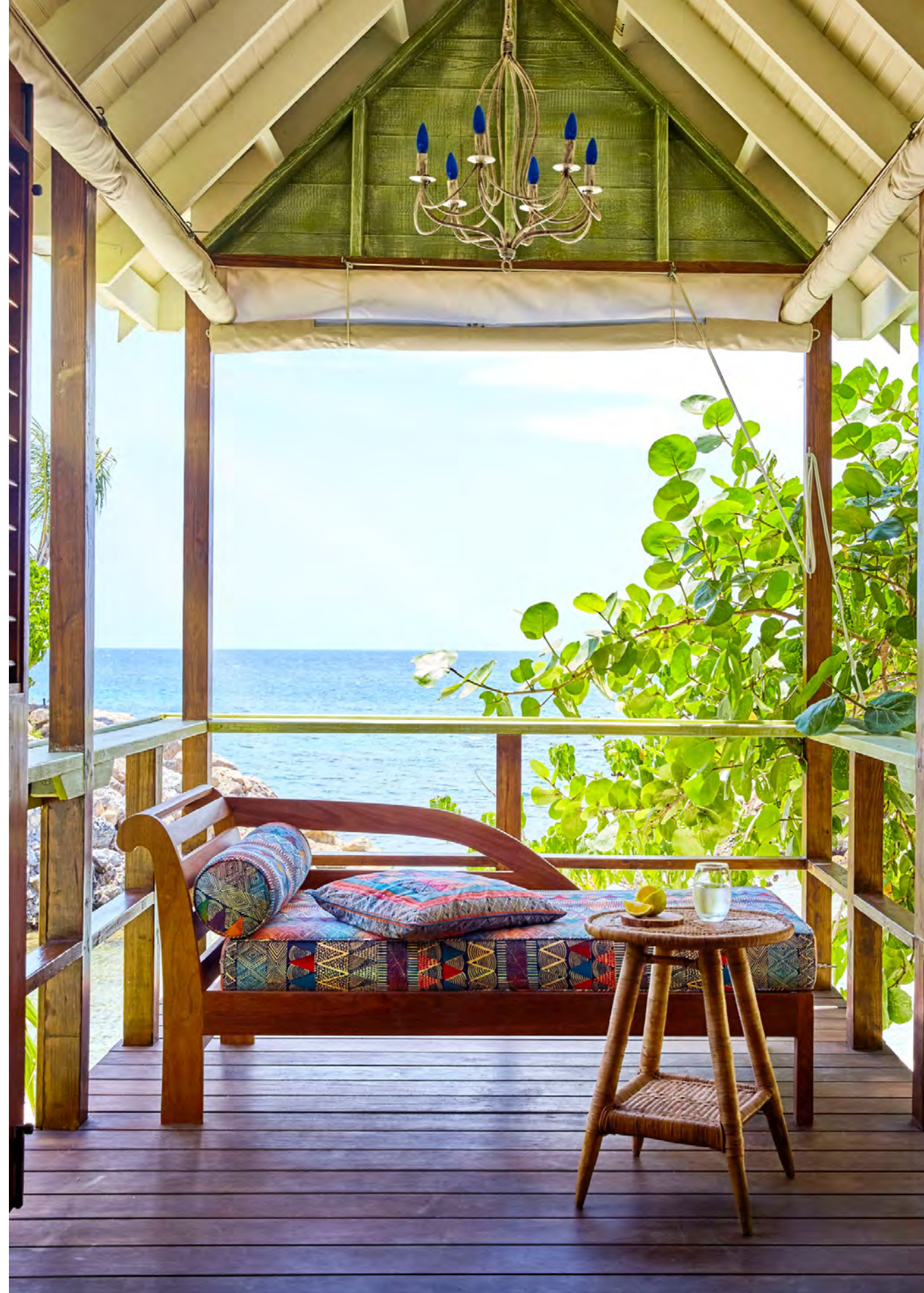
GoldenEye - One & Two-Bedroom Beach Huts - 425 to 1,050 sq. ft.