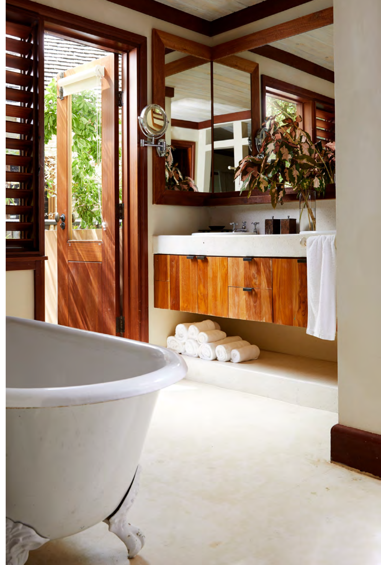
GoldenEye - One Bedroom Beach Villa 1,100 sq. ft.