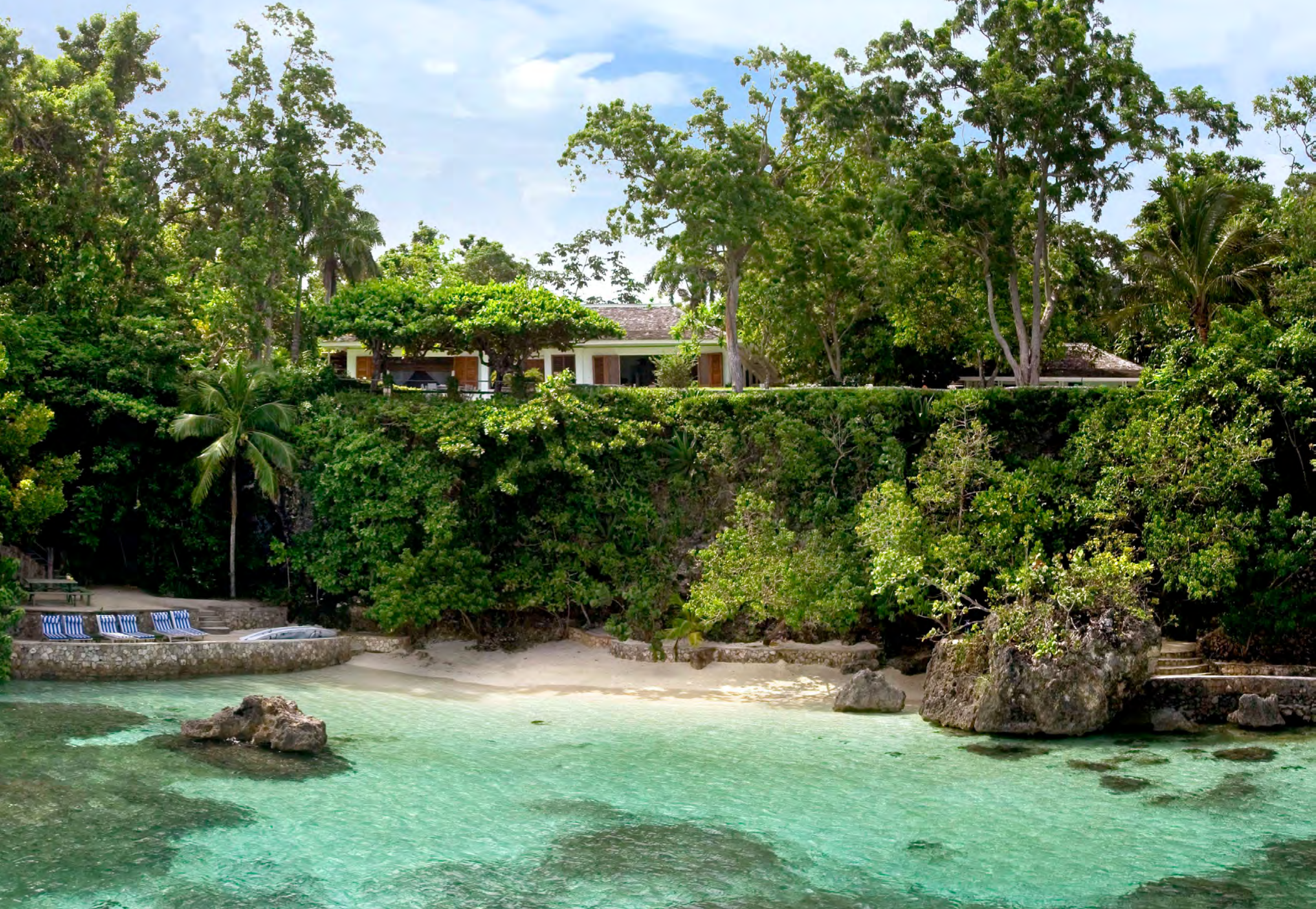
The 5-Bedroom Fleming Villa – the original home of Ian Fleming – 5,566 sq. ft.