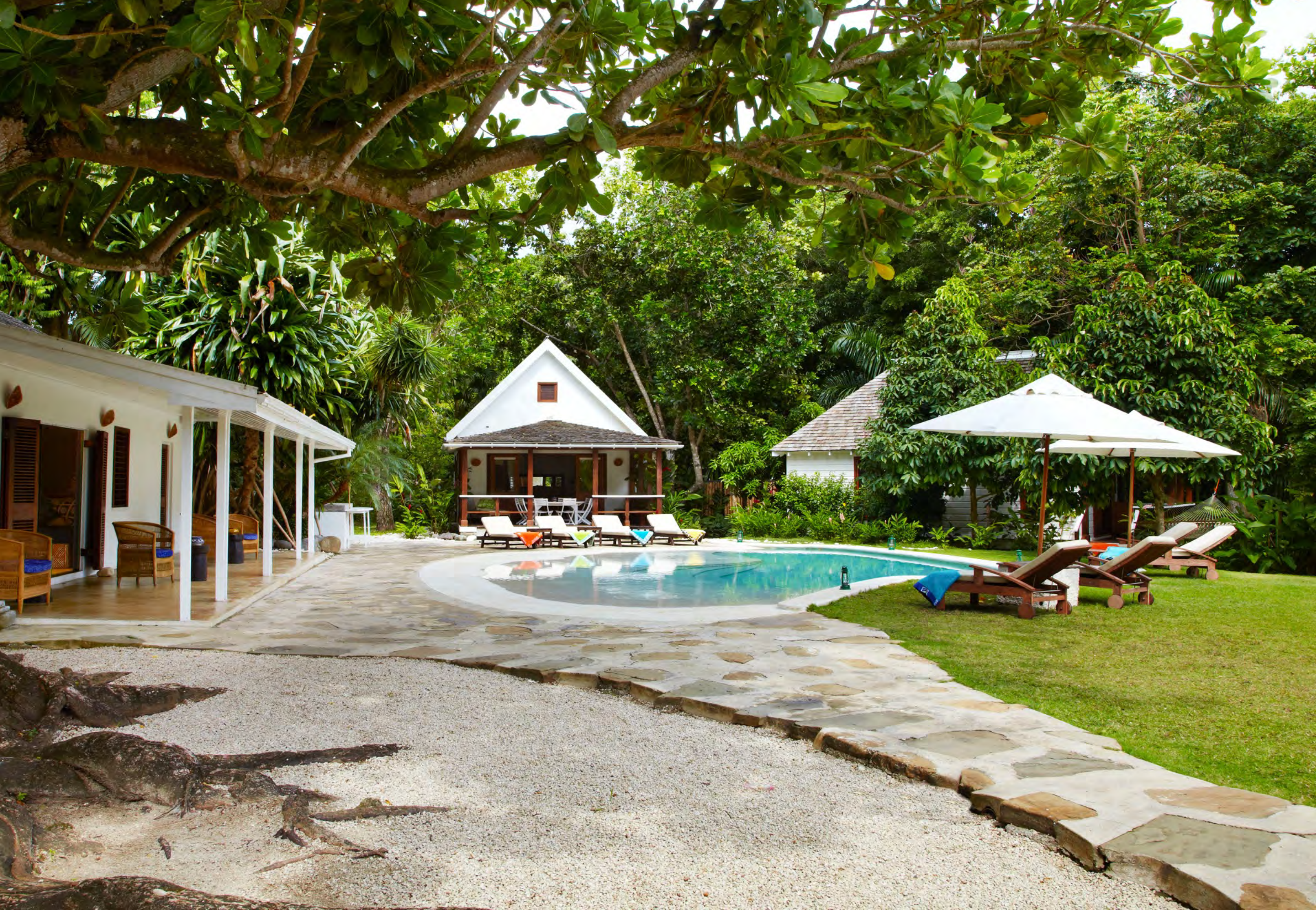
The Fleming Villa - Two additional guest cottages, villa pool and media room