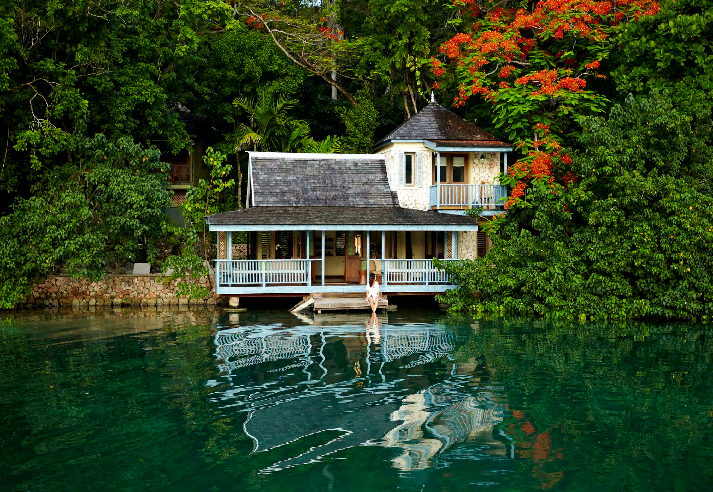
The FieldSpa at GoldenEye