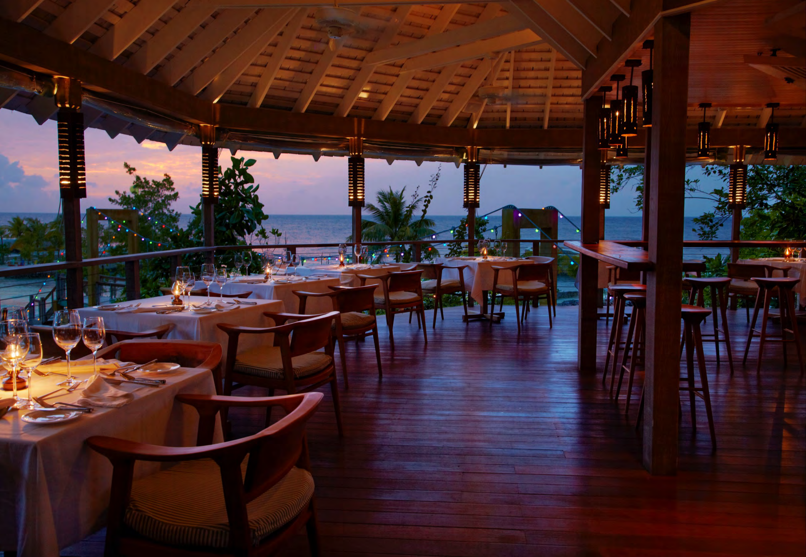
GoldenEye - The Gazebo Restaurant