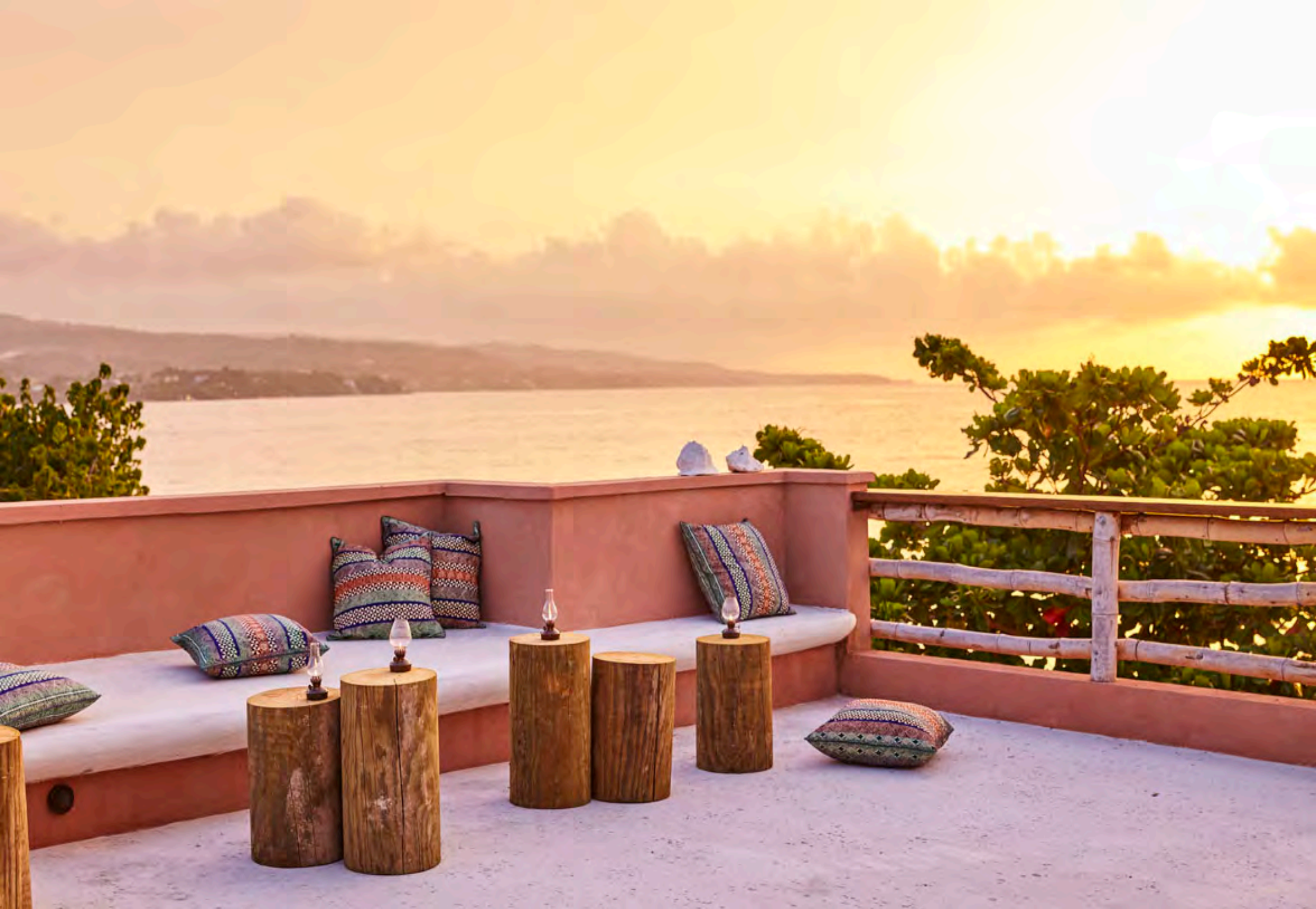
GoldenEye - Shabeen Rooftop Terrace