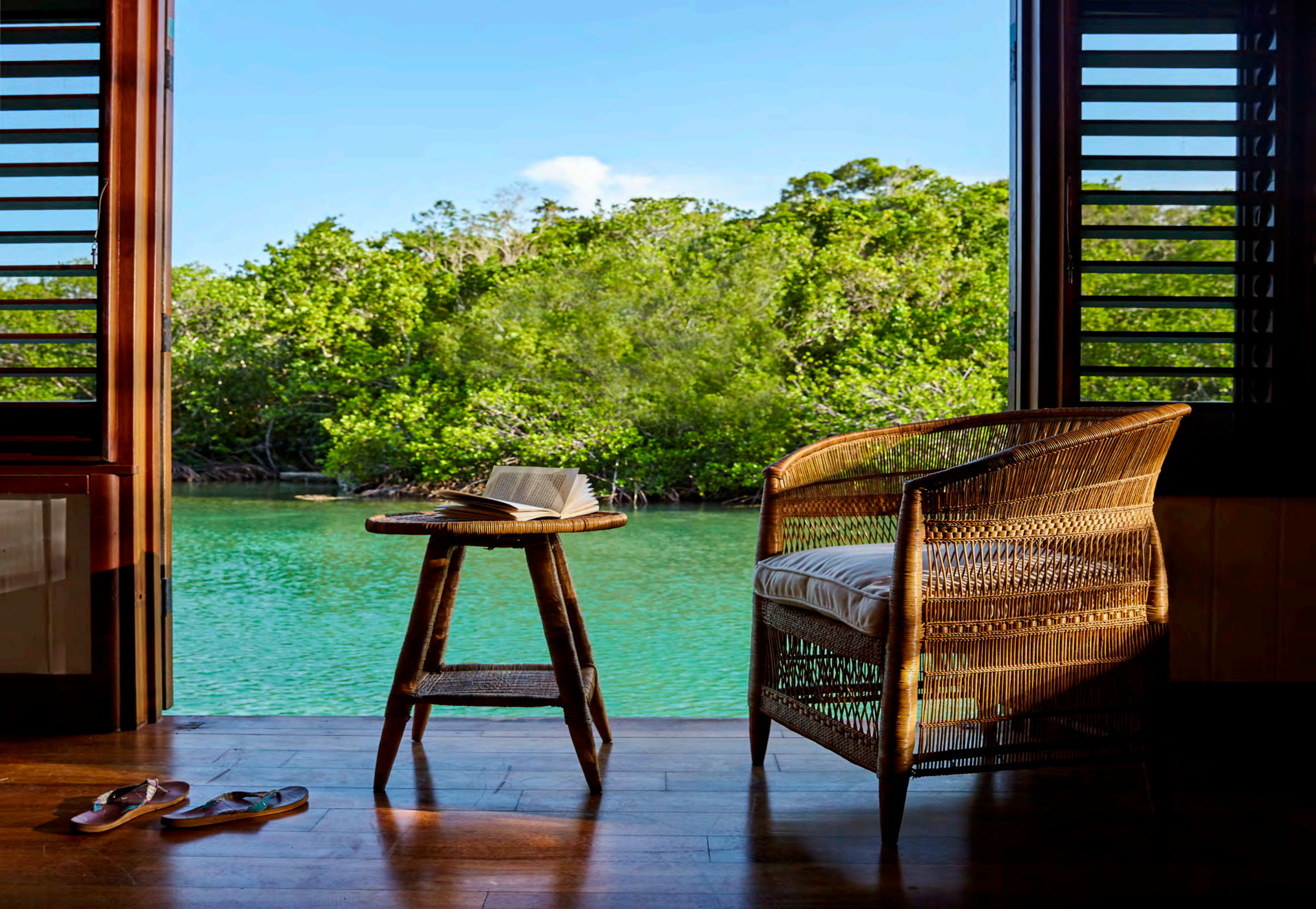
GoldenEye - One Bedroom Lagoon Cottage 720 sq. ft.