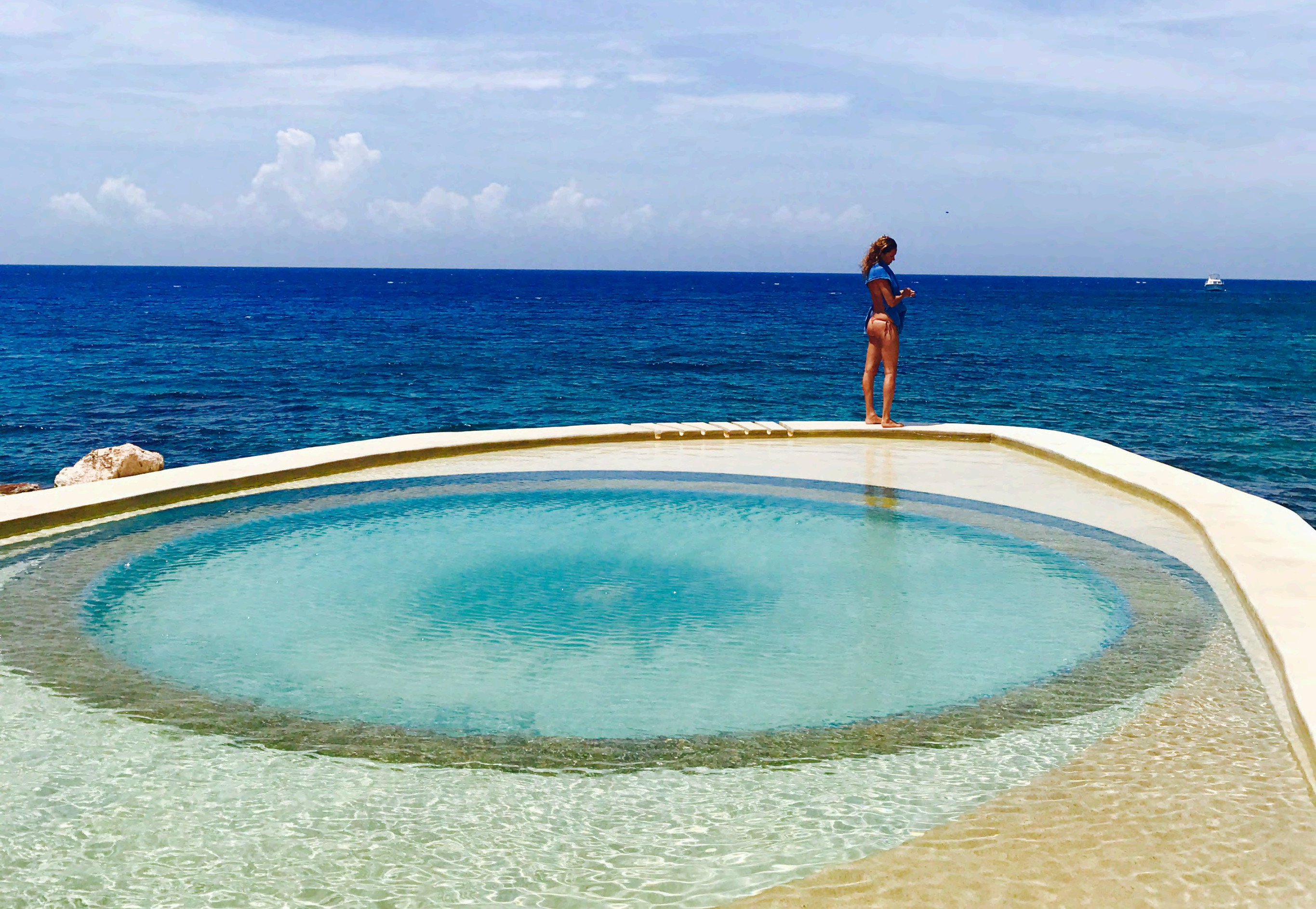
GoldenEye - 3 Swimming Pools including the Golden Eye Pool