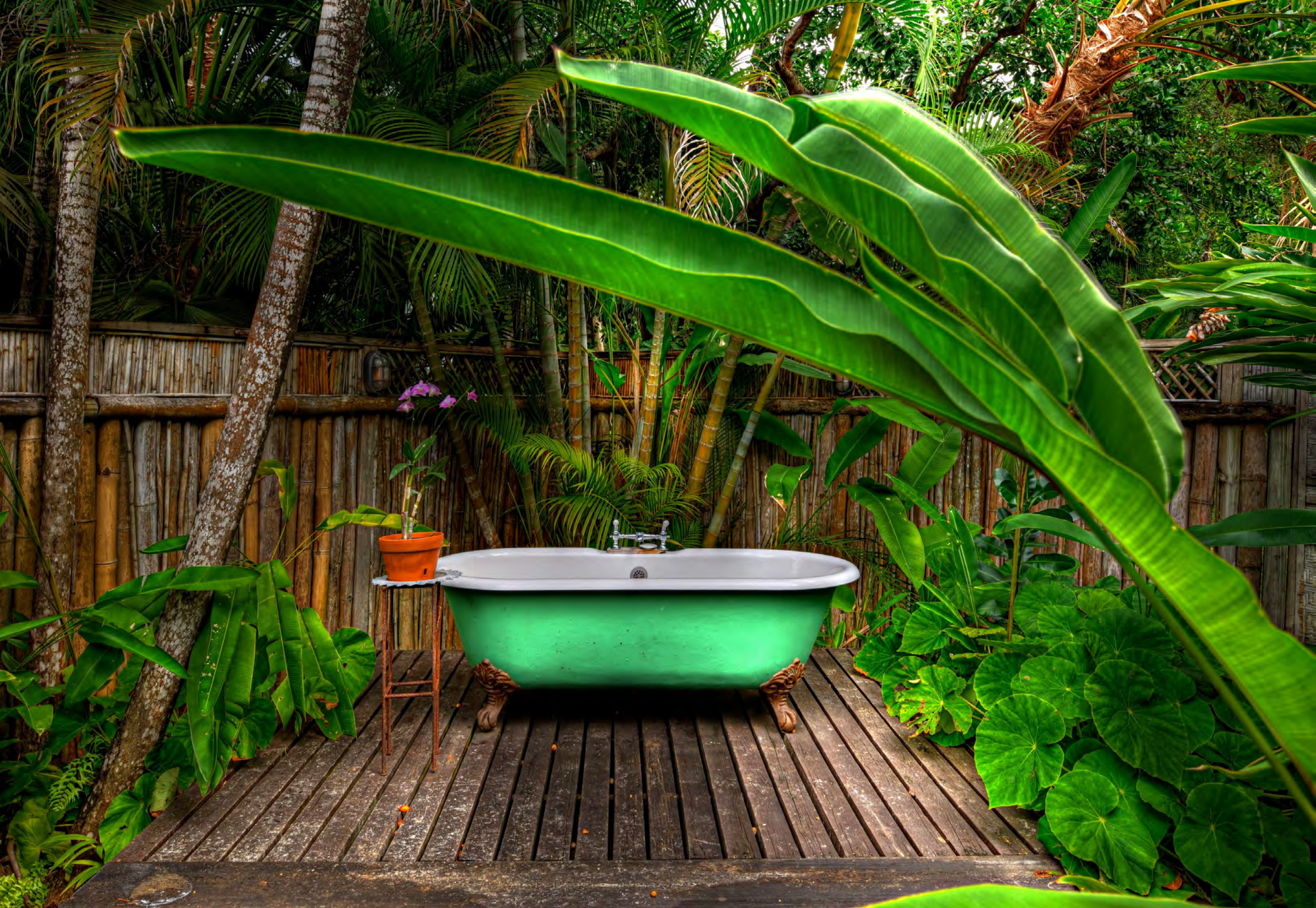
The Fleming Villa - Outdoor Bathrooms with claw foot bathtubs