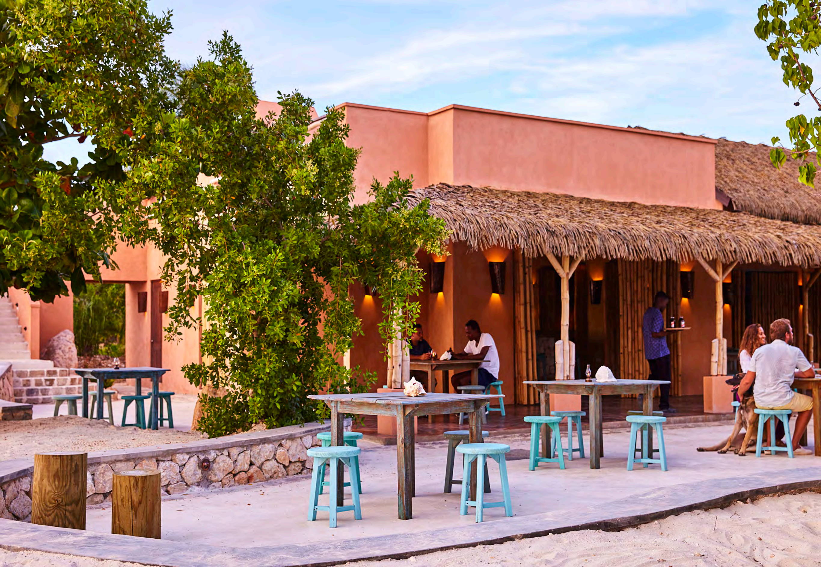
GoldenEye - Shabeen Bar with rooftop terrace and TV lounge