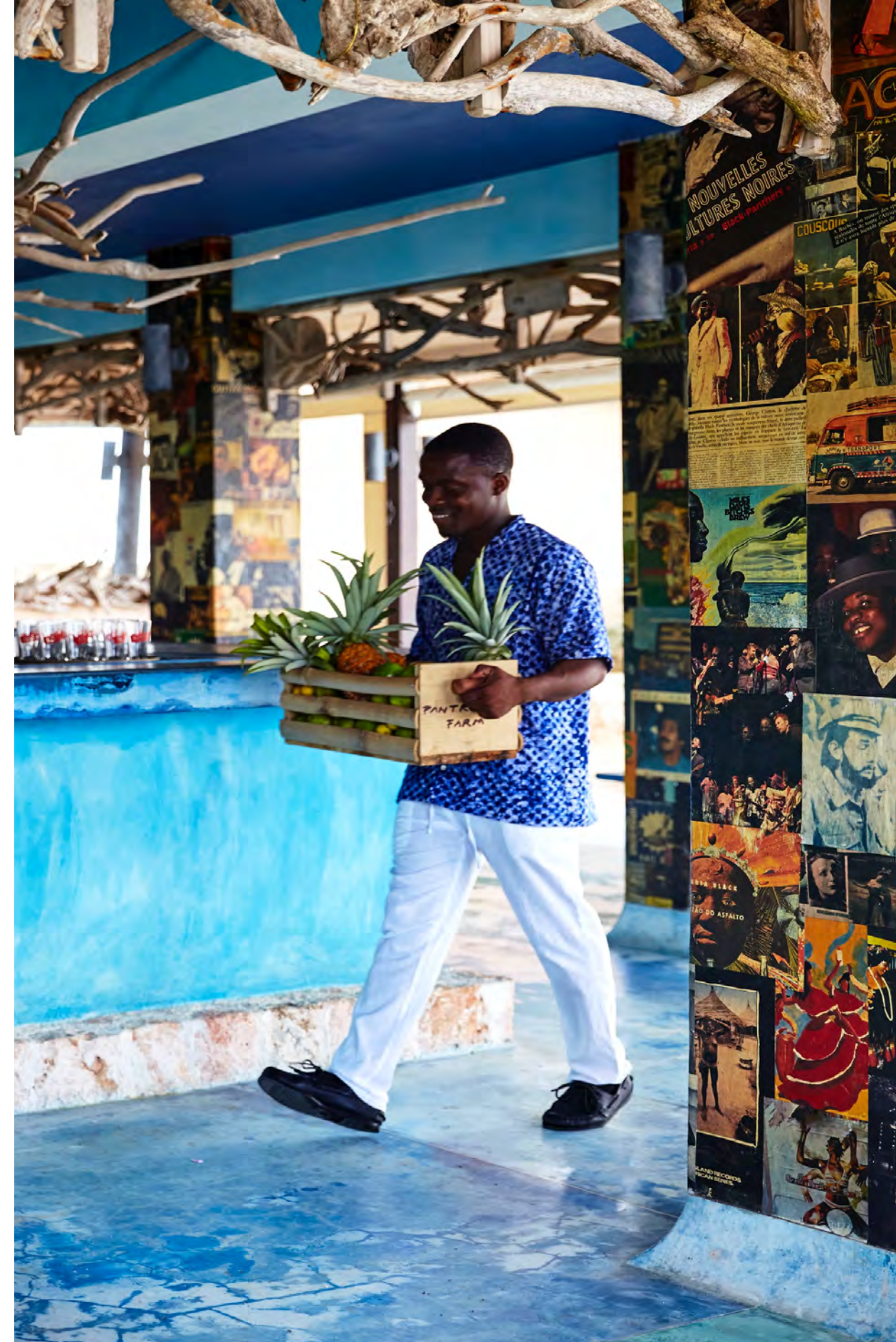
GoldenEye - Bizot Bar & Restaurant. Organic produce from Island Outpost farm, Pantrepant