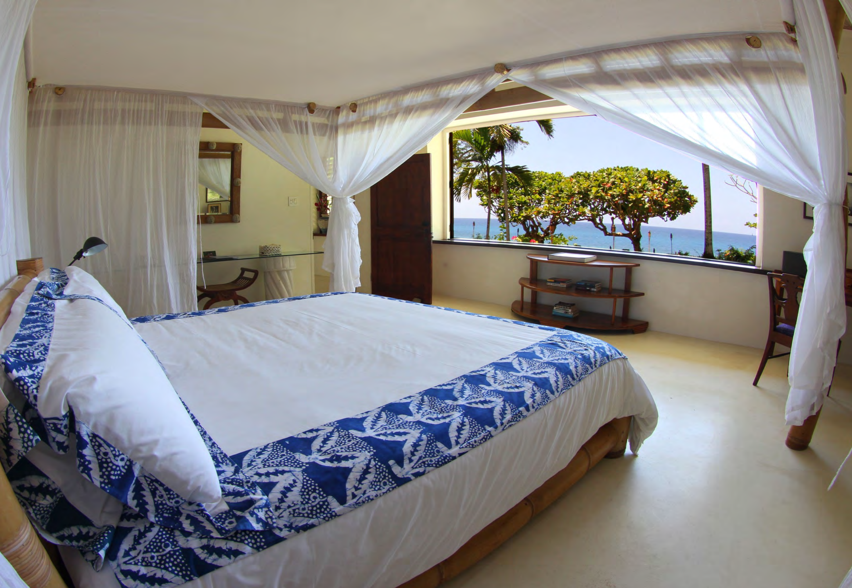
The Fleming Villa - Master Bedroom