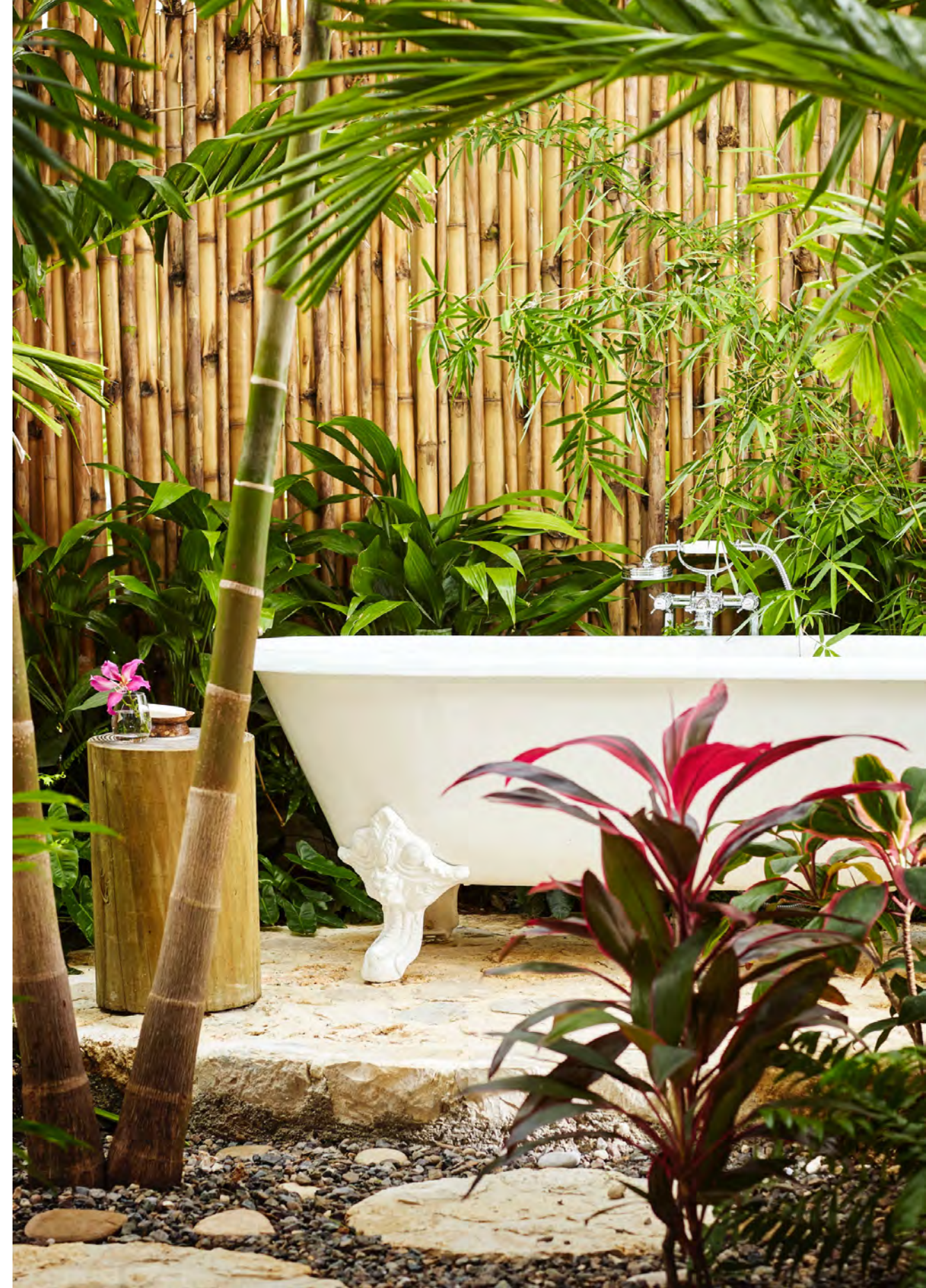
GoldenEye – Beach Hut with Open-Air Dune Room & Outdoor Bath