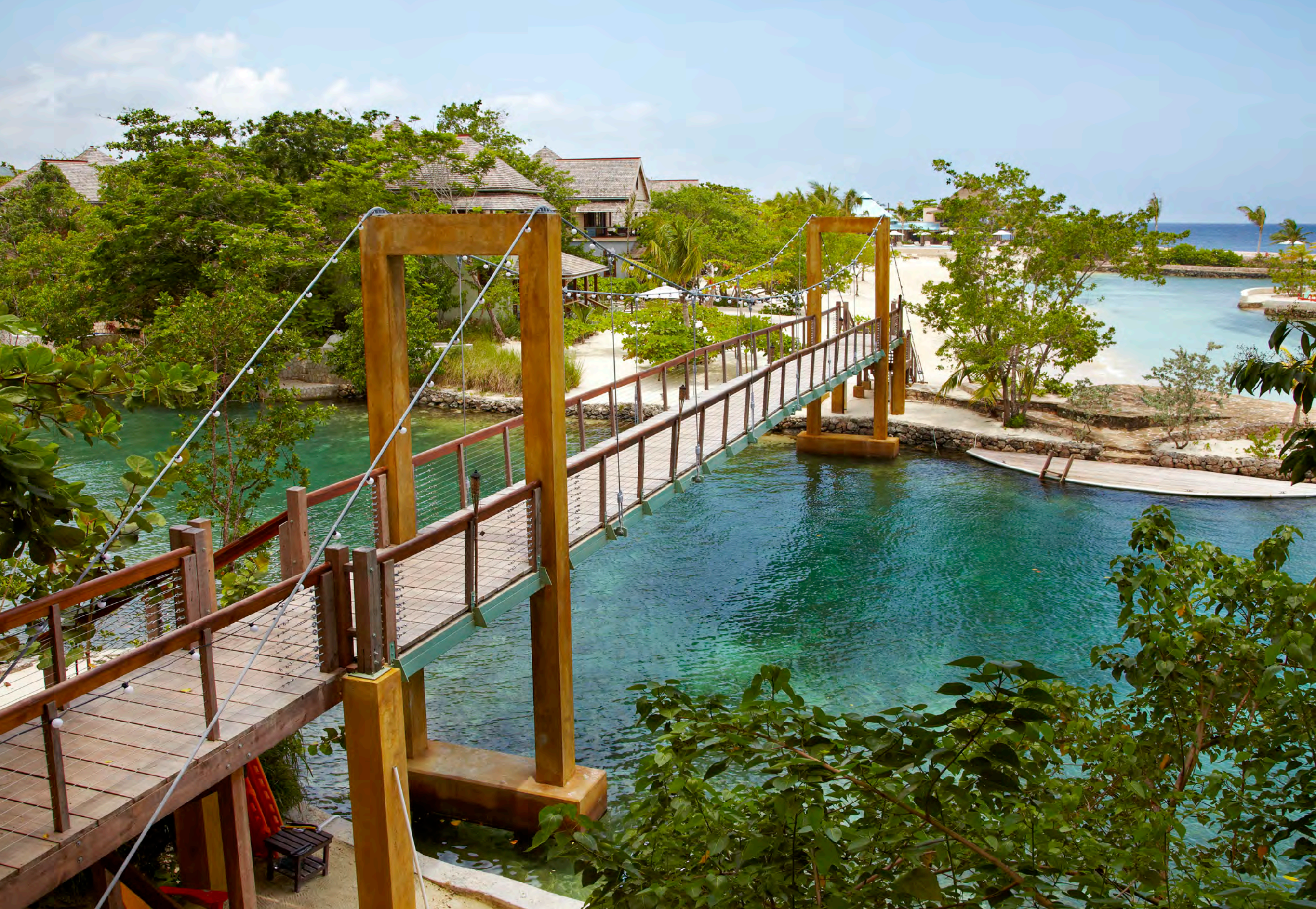
GoldenEye - Private 6 acre sea water lagoon