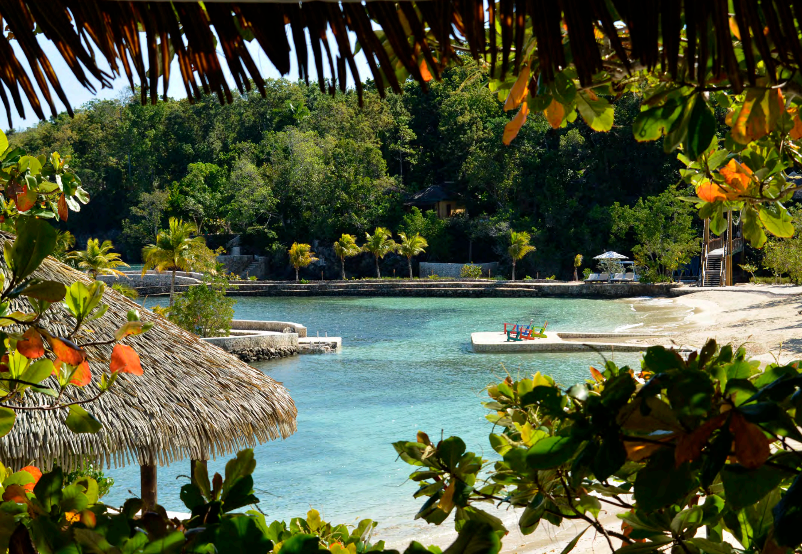
GoldenEye - "Low Cay" private beach