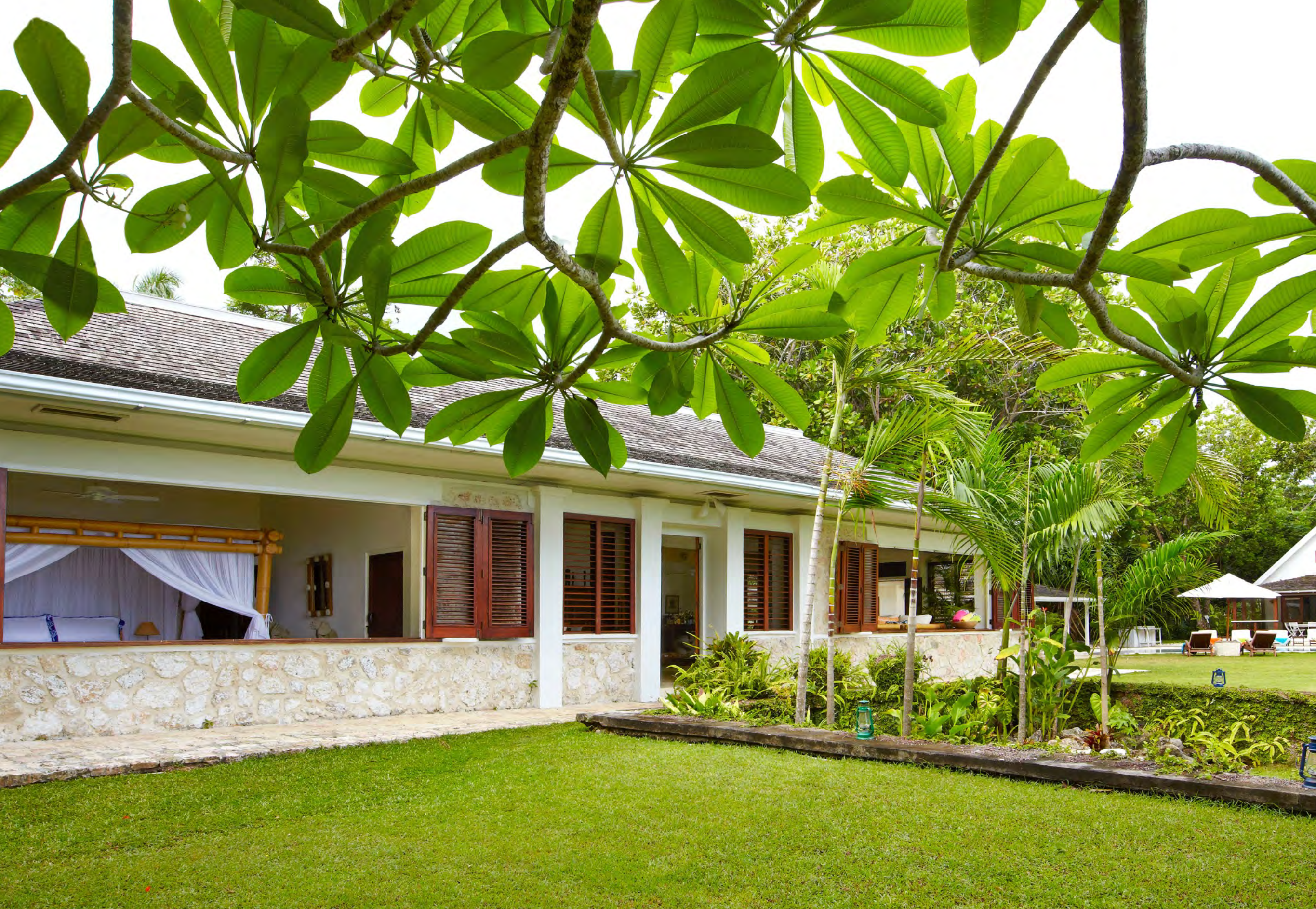
The Fleming Villa - The main house with 3 bedrooms